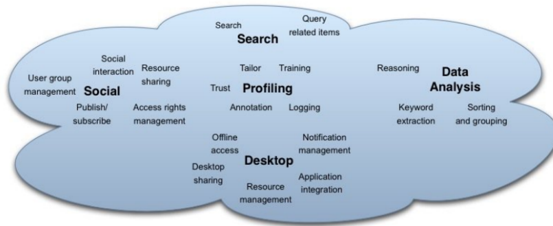
Fig. 1. Services of the Social Semantic Desktop.

Desktop focuses on services for the resource management . Resources can be created, modified, or viewed. They can be shared with other users and synchronized for offline working . For the data exchange between desktop applications NEPOMUK provides interfaces that enable services such as a Semantic Clipboard [7]. The SSD should further support desktop sharing for collaborative working on resources. NEPOMUK users can also define in their profile how they want to be informed about the occurrence of events ( e.g. , via email, instant messaging, or SMS).